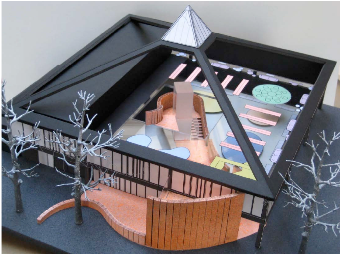
Burnt Oak Library Model.